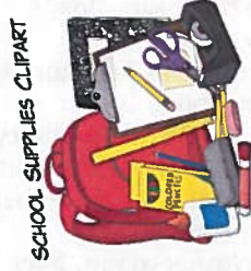
SCHOOL SUPPLIES CLIPART

SIGN-UP SHEETS AT INFORMATION CENTER / ENVELOPES AVAILABLE IN PEWS