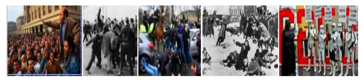
r eason Labor movements led by union leaders are mediochre copies of business movements. This ends!

during wage negotiations. They are led by elitist uni educated techno crats who fake social-justice devoid of work-experience, members of the Capitalist-system. They plunder members funds & misuse mem- bers loyalty for their own political ambitions. These fakes are the