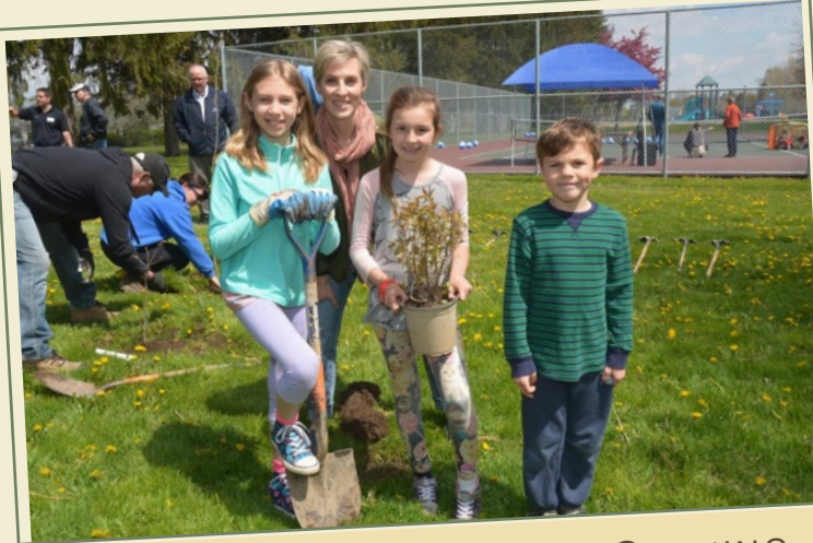
LAUGHTON HEIGHTS PARK OPENING MAY 13th, 2017

To see the information about our current board please visit our website at www.sherwayhomeowners.com .