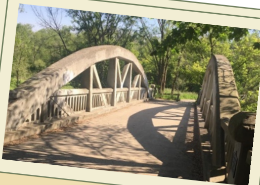
MIDDLE ROAD BRIDGE SPRING 2017

On the TRCA web site ( http://www.trca.on.ca/dotAsset/174547.pdf which is also available on the SHORA web site), there is a 2013 rendering of the trail's path & scope of work. The TRCA representative also mentioned in the meeting that the 100-metre section below the QEW will likely be closed to pedestrians during the upcoming QEW/Etobicoke Creek multi-year bridge reconstruction project, however the remainder of the new trail, and a repaired Sherway Drive, will be accessible.