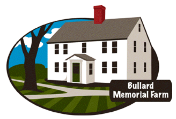
7 Bullard Lane Holliston, MA 01746 Since 1658