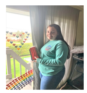
Taylor Beer Lehigh PA