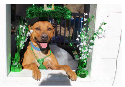
Dear PAWS Supporters and Donors:

We are thrilled to tell you because of your generosity and support, we have been able to assist over 600+ homeless animals in 2017, It's allowed us to assist in helping hundreds of animals get spay/neuter surgeries in Swain County this year.