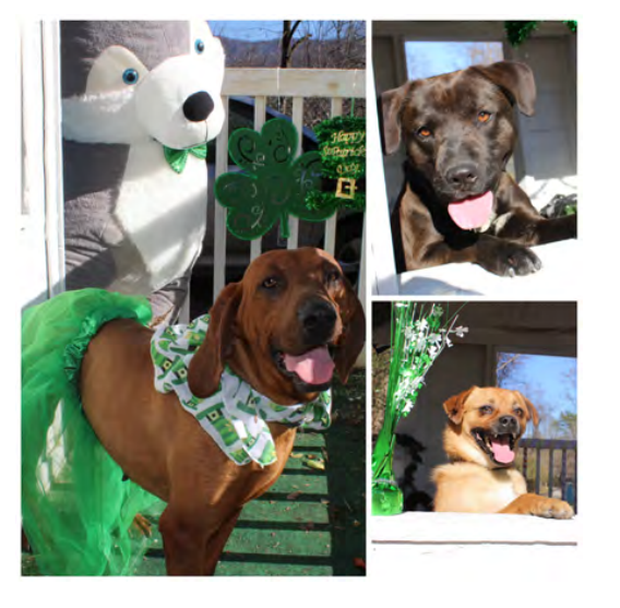
HAPPY ST. PATRICKS DAY & HAPPY EASTER FROM ALL OF US AT PAWS!!