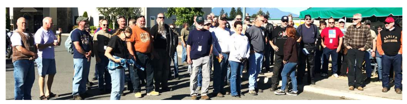
Participants assemble before a ride at the Evergreen National, Sequim , WA