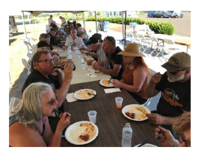
Saturday nights' BBQ dinner