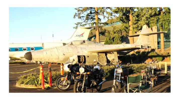
Vintage aircraft and motorcycles