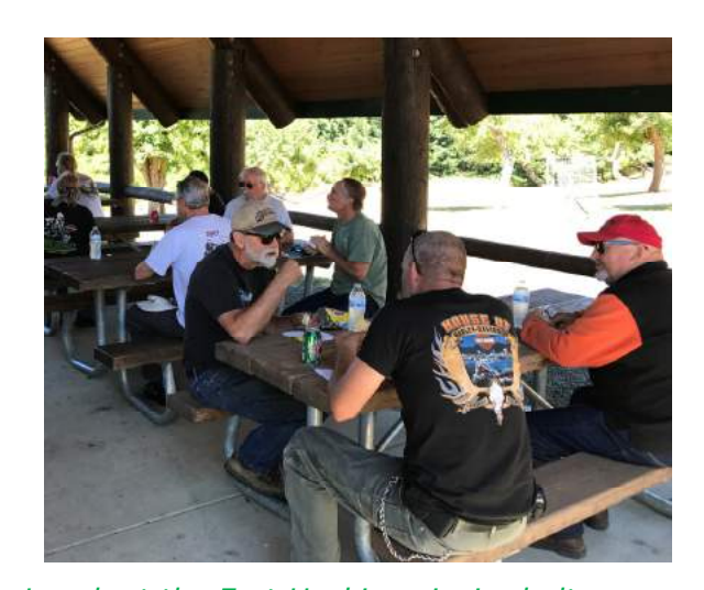
Lunch at the Fort Hoskins picnic shelter