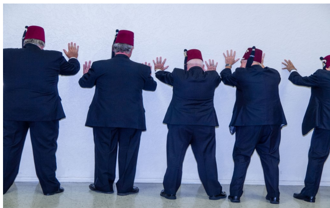
This is what happens if you don't wear your mask