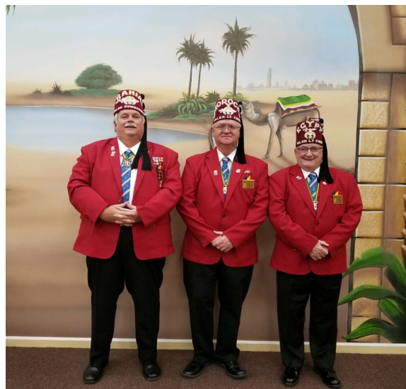
International Officers at SASA