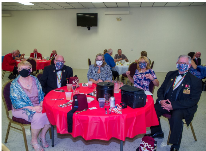
The Smart Ones In The Crowd