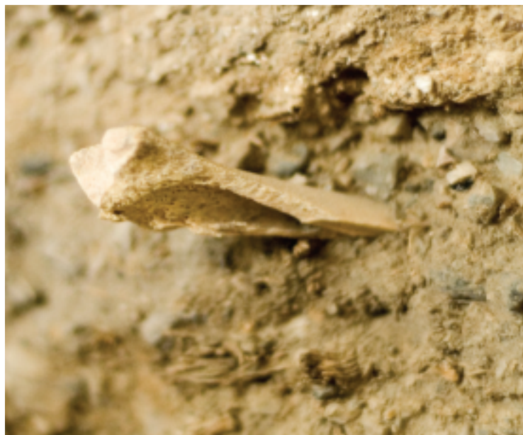
Bone jutting out of wall

They're now examining the Fremont culture (A.D. 600