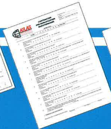
CONTRACTOR REFERENCES QUALIFICATIONS