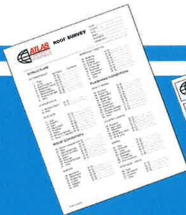
IN-DEPTH SITE SURVEYS