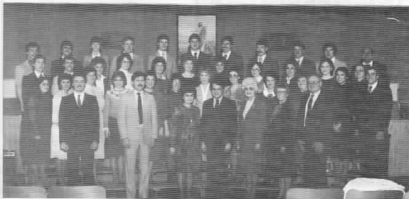
FACULTY-STUDENT BODY OF THE SPRING TERM 1984

FACULTY-STUDENT BODY OF THE FALL TERM 1983