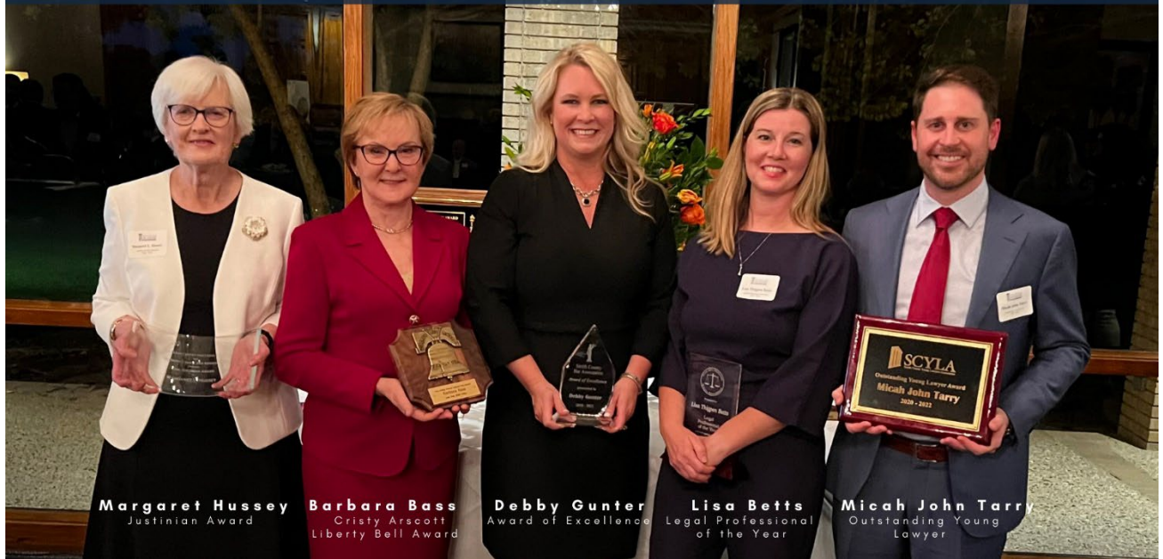
Margaret Hussey Justinian Award