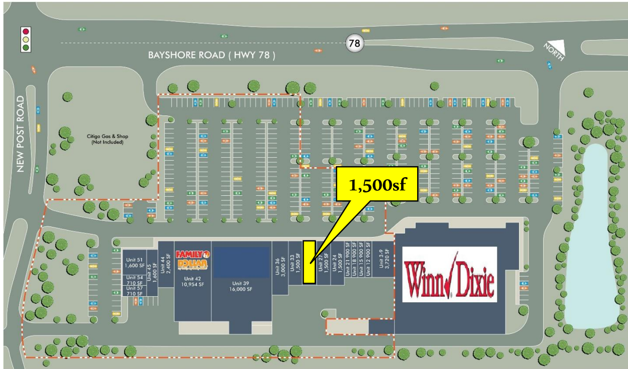
FOXMOOR SHOPPING CENTER