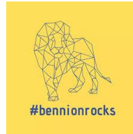
Exhibit: 4D3 Board Meeting: 9/3/2019