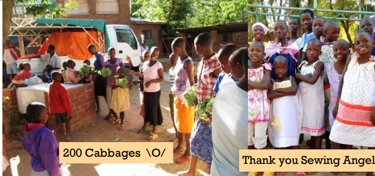
200 Cabbages \O/

LOVE, LAUGH, CRY ... LIVE !!!!! HEY \O/ WHO ARE WE GOING TO HELP IN HEAVEN ???? Hmmmm and what are we taking with us ???? ... And then there was the good buddy who took the gold from his friends ...coffin ( the gold placed there as per his Will) and ... replaced it with a cheque as it would be easier to carry.... What a heart of consideration \O/ so much for that old joke...Lets not forget the part about being led wherever, however, it is, is good... help where we can \O/ hmmm and the need aint necessarily the call... Lets help who we can, when we can, with what we can, as much as we can, as often as we can as long as there is food or money in the can, pray and obey ... give or not ...yeh or nay ... go or stay... the pay is the same isn't it! (not a question :) \O/