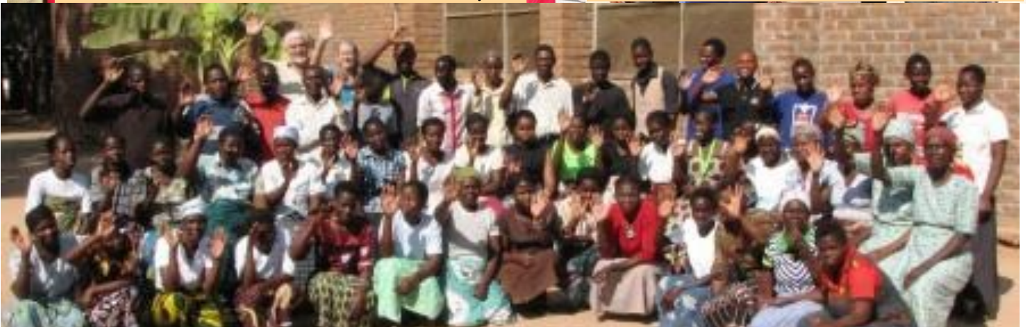
The Main Team of wonderful people who carry TMC thru daily... Baby Care Ladies, Child Care Men, Cooks, Teachers, Managers, General Workers, Guards and temporary construction workers...