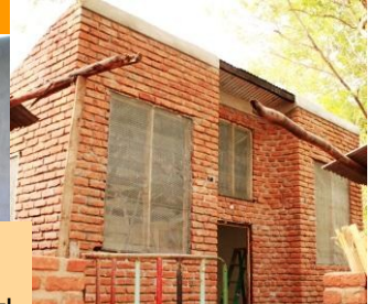
Our little boys new house thanks much to Primrose Lane School UK \O/