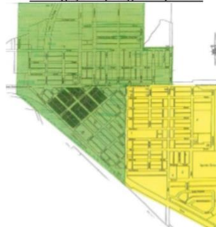
Garbage / Recycling Pickup Areas

Please have bins at least 1.5 feet apart at curbside