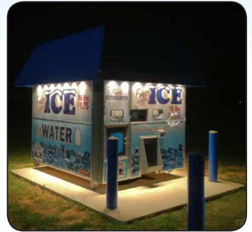
IM2500 shown with optional light kit

By design, the IM2500 is built to accommodate additional ice makers as your business grows. A second ice maker offers owners the opportunity to increase their recovery time during peak demand times, allowing the machine to keep up with even the highest demand locations. And because each ice maker can function independently, the owner can elect to scale back the number of ice makers producing ice based on daily volume needs - which allows owners to manage operating costs more efficiently to MAXIMIZE PROFITS .