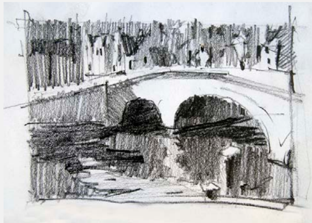
The Game Plan

In the many years I have been teaching watercolor, I have had the chance to see how students will often pass over any preliminary considerations about painting, and decide in favor of just picking up the brush and charging full speed ahead. In my own work, I experience the same temptations to 'cut to the chase.' Obviously the joy of painting can be very persuasive. However, there are a number of benefits to resisting that temptation. Have you ever watched an athlete prepare for an athletic event? He or she likely will be taking part in some kind of warm-up exercises. It's just part of the game plan. Not to do so would be to flirt with physical disaster. As a painter, involving oneself in the act of preliminary planning can be considered akin to that warming-up period. Just think of it as an attempt to avoid 'paper disaster'. It helps get our creative juices flowing. It's at this time that good things can happen. Mental cobwebs are brushed aside and ideas start