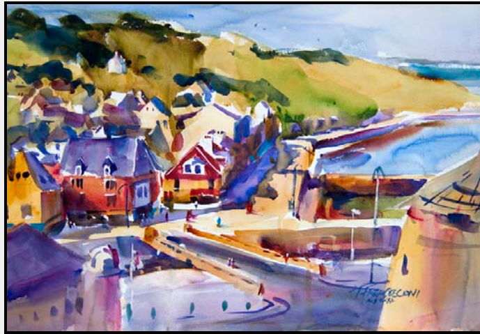
Port en Bessin

I don't know, maybe it's the lack of precipitation in Chicago this winter but I just haven't had much inspiration for snow-laden landscapes. What I have been busy with is figurative works, along with paintings from my France trip. I have included some of these paintings in this newsletter.