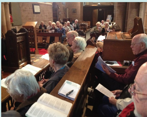
Singing Frances Havergal hymns where they were written, here at Astley Church

Cost of obtaining passports, visas, handling fees, excess baggage and forwarding of baggage, entrance fees not mentioned, optional tours, transportation from cities other than San Francisco CA and vice versa, tips for personal favors, and costs resulting from absence or deviation from the itinerary and any items not mentioned as being included.