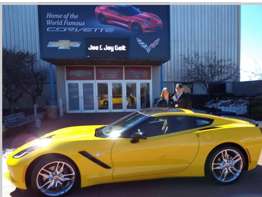
Marquee in front of factory