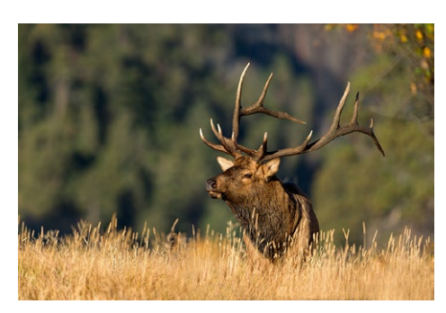
Over the Hill - 27 Cheryl Callen