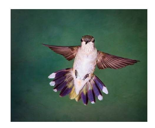
Just Hanging Out - 27 Rose Epps