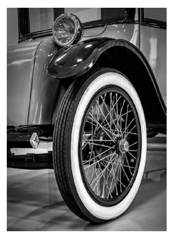
Classic- 27 Rose Epps