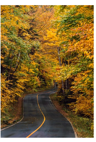
Up A Road Less Traveled - 27 Lois Schubert