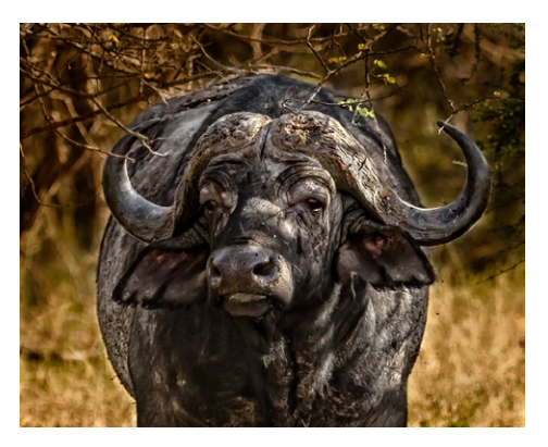
Cape Buffalo - 27 Linda Sheppard