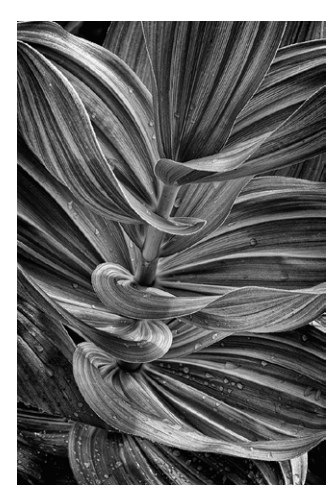
Corn Husk Lily - 27 Jeff Lava