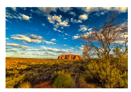
Uluru Sunset - 27 Dan Tonissen