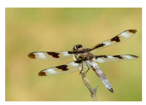
Twelve-Spotted Skimmer - 27 . Desha Melton