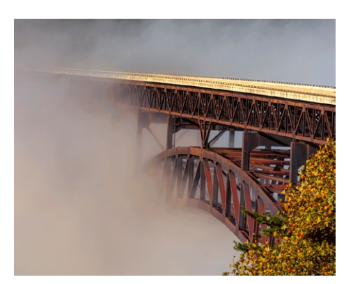
Into the Fog - 27 Linda Sheppard