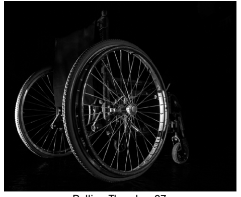
Rolling Thunder- 27 Linda Avitt