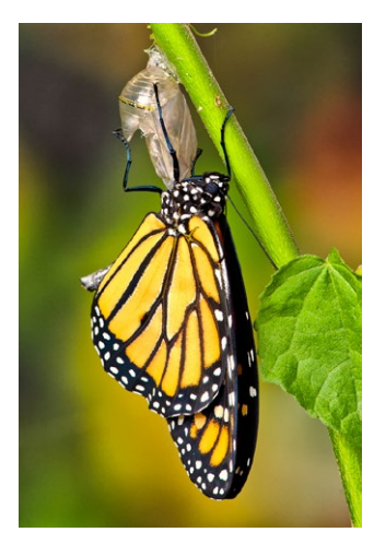
Monarch Emergent - 27 Brian Loflin