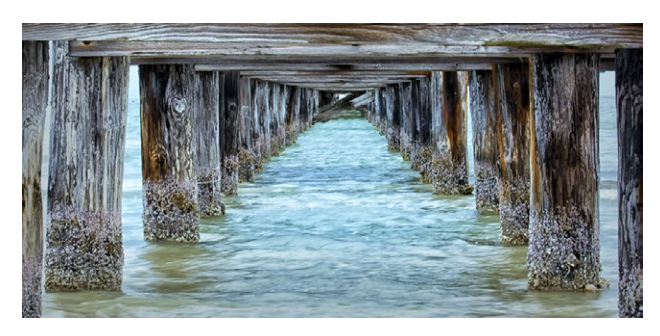
Under the Wharf - 26 Paul Munch