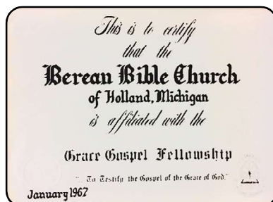
A certificate showing Berean Bible Church was affiliated with Grace Gospel Fellowship.