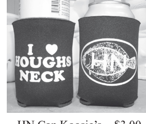
HN Can Koosie's ~ $3.00