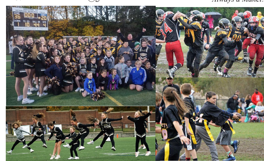
top: 2016 City Champions, Manets and Apahces playing hard Cheerleaders helping the team win, Flag Football facebook photos