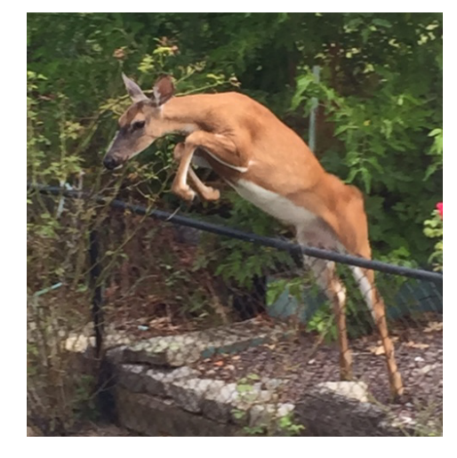
She jumped over fence with 100% ease from the Romans next door yard. Scared me cuz I was like 5 feet from her. Now I know when all my cukes & tomatoes have gone.