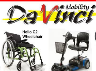
Helio C2 Wheelchair