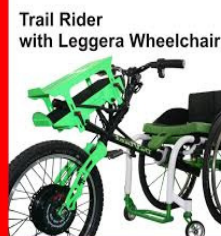
Trail Rider with Leggera Wheelchair