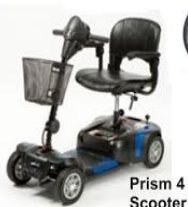
Prism 4 Scooter