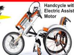
Handcycle with Electric Assist Motor