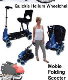
Quickie Helium Wheelchair