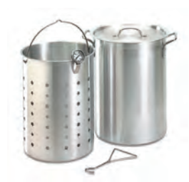
TURKEY FRYER KIT MODEL: 3570

Durable and functional, Bamboo Cutting Boards are perfect for preparing meats and vegetables for grilling. 12"x 14".