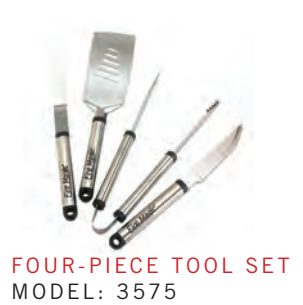
Includes a fork, spatula, knife and tongs. Constructed of quality stainless steel.

Stainless steel light easily converts from table top to a taller floor model. 20W halogen bulb, water resistant. UL listed.