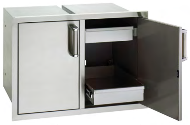
DOUBLE DOORS WITH DUAL DRAWERS