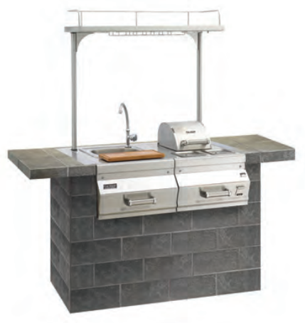
CUT-OUT:12"x3634" x 23 1/2"