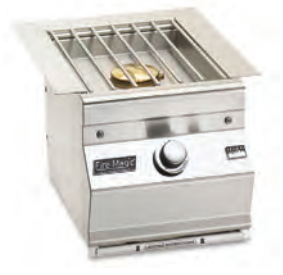
SINGLE SIDE BURNER MODEL: 3279-1 CUT-OUT:12"x11½"x14"

Prepare restaurant-quality steaks with the double searing station. When steaks are flash-cooked at 1200°, juices are locked and meats are tender and full of flavor. With 32,000 BTUs, the double searing station is a welcome companion to your Fire Magic grill. A 24,400 BTU Single Searing Station is also available, shown on page 16.