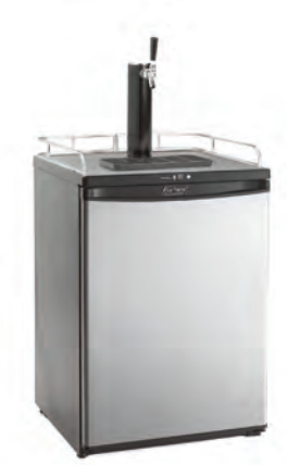
KEGERATOR MODEL: 3591

4.2 cubic foot. Interior light and, security lock and key. Reversible door hinge and lock. When used outdoors, it must be installed in an enclosure.