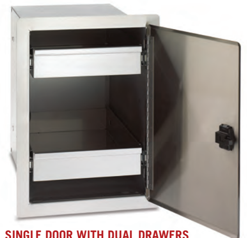
SINGLE DOOR WITH DUAL DRAWERS