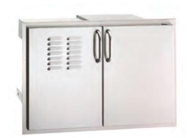
DOUBLE DOORS WITH TANK TRAY, LOUVERS, AND DUAL DRAWERS MODEL: 33930S-12T

CUT-OUT: 15 ¾" x 14 ½" x 20 ½" CUT-OUT: 5 ¼" x 14 ½" x 20 ½" CUT-OUT: 21" x 30 ½" x 20 ½"