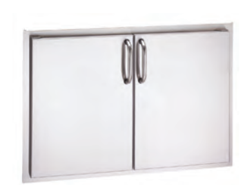
DOUBLE ACCESS DOORS