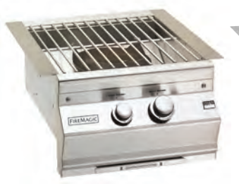
POWER BURNER 19-S0B1N-0