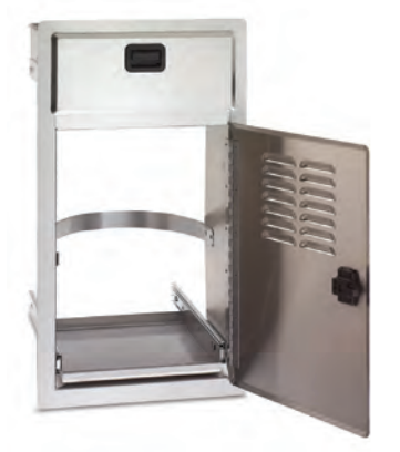
DRAWER WITH PROPANE DOOR ASSY