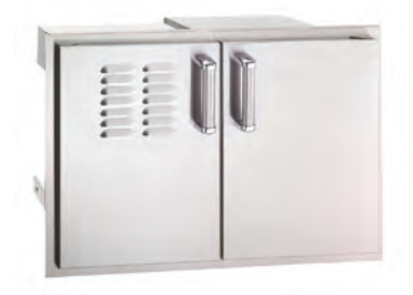
DOUBLE DOORS WITH TANK TRAY, LOUVERS, AND DUAL DRAWERS