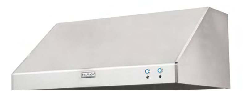
Fire Magic introduces the first and only vent hood specifically designed and engineered for outdoor grills. Installs above Fire Magic grills to quickly remove excess smoke and heat from covered patios.

Accepts and protects regular or jumbo rolls. Premium 304 stainless steel ensures a uniform look for all Fire Magic island products.