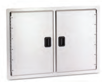
DOUBLE ACCESS DOOR