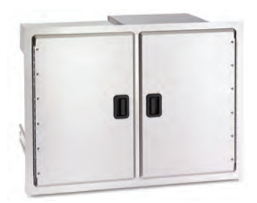
DOUBLE DOORS WITH DUAL DRAWERS AND TRASH TRAY