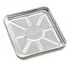
DISPOSABLE DRIP TRAY LINER MODEL: 3557 (4-pack)

Fire Magic's 3-Hour Safety Timer offers additional safety and automatically shuts off gas flow at pre-set times. Easy to install. Great for apartment and condominium use.