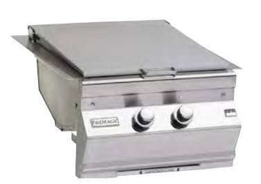
DBL SEARING STATION MODEL: 3288-1

The largest and most powerful side cooker available, the Power Burner provides the high heat perfect for wok cooking or frying a turkey! Offering a range of 3,000 to 60,000 BTUs. Available with porcelain cast iron or stainless steel grids.