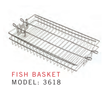
A handy, stainless steel basket for skewers, burgers, ribs or fish.

You'll be amazed at how tender a deepfried turkey can be. Kit includes pot, inner basket with sturdy handle and thermometer probe. Great as a crab or corn pot.