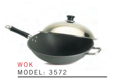
Hard-anodized stick-resistant lined interior surface measures 14" in diameter.

Fire Magic's Blender is the perfect companion for any outdoor kitchen, bar caddy or beverage center. The attractive and sturdy stainless steel cover protects the 675 watt motor from the elements.