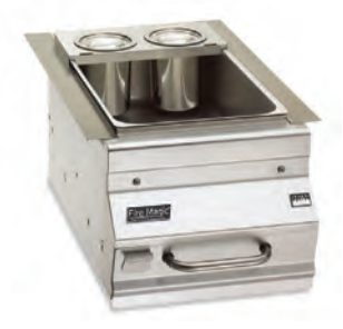
BAR CADDY MODEL: 1D-S0 CUT-OUT:12"x141/4"x 22 3/4"

Bar Caddy comes equipped with a towel bar, bottle opener, sliding storage drawer, two stainless steel bottle sleeves and an installation hanger. Avaialble with the optional steam warming accessory.