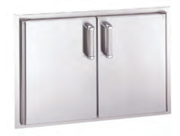
DOUBLE ACCESS DOORS