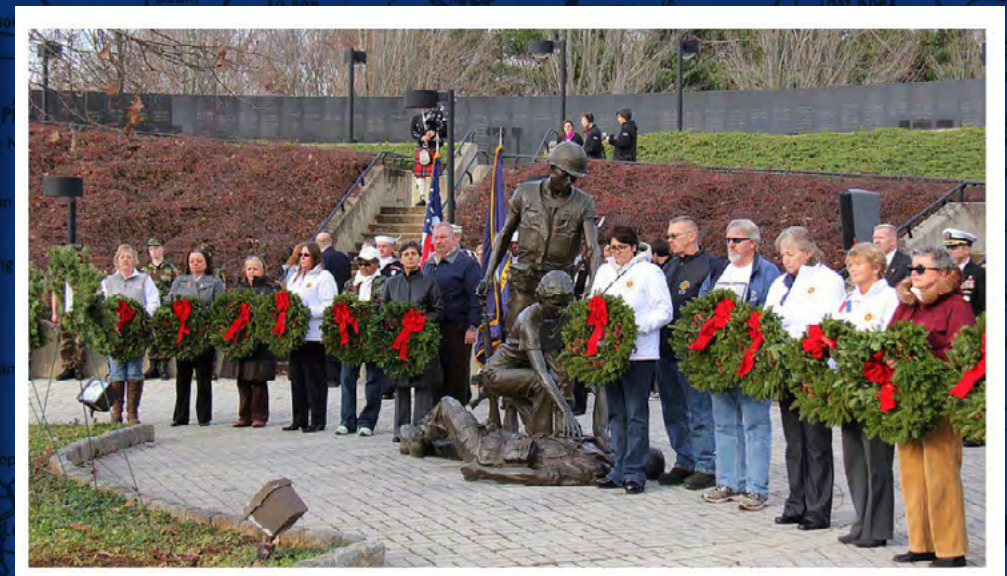
A group of volunteers prepare to present wreaths during a Wreaths Across America ceremony held at the New Jersey Vietnam Veterans Memorial.