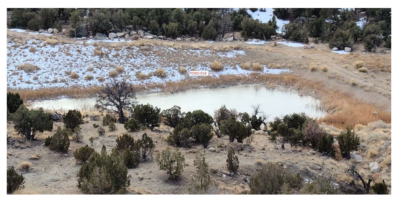
Sediment Pond 018, located west of Sed Trap #1 – photo looking southerly Pond has some water. No discharge in 2023