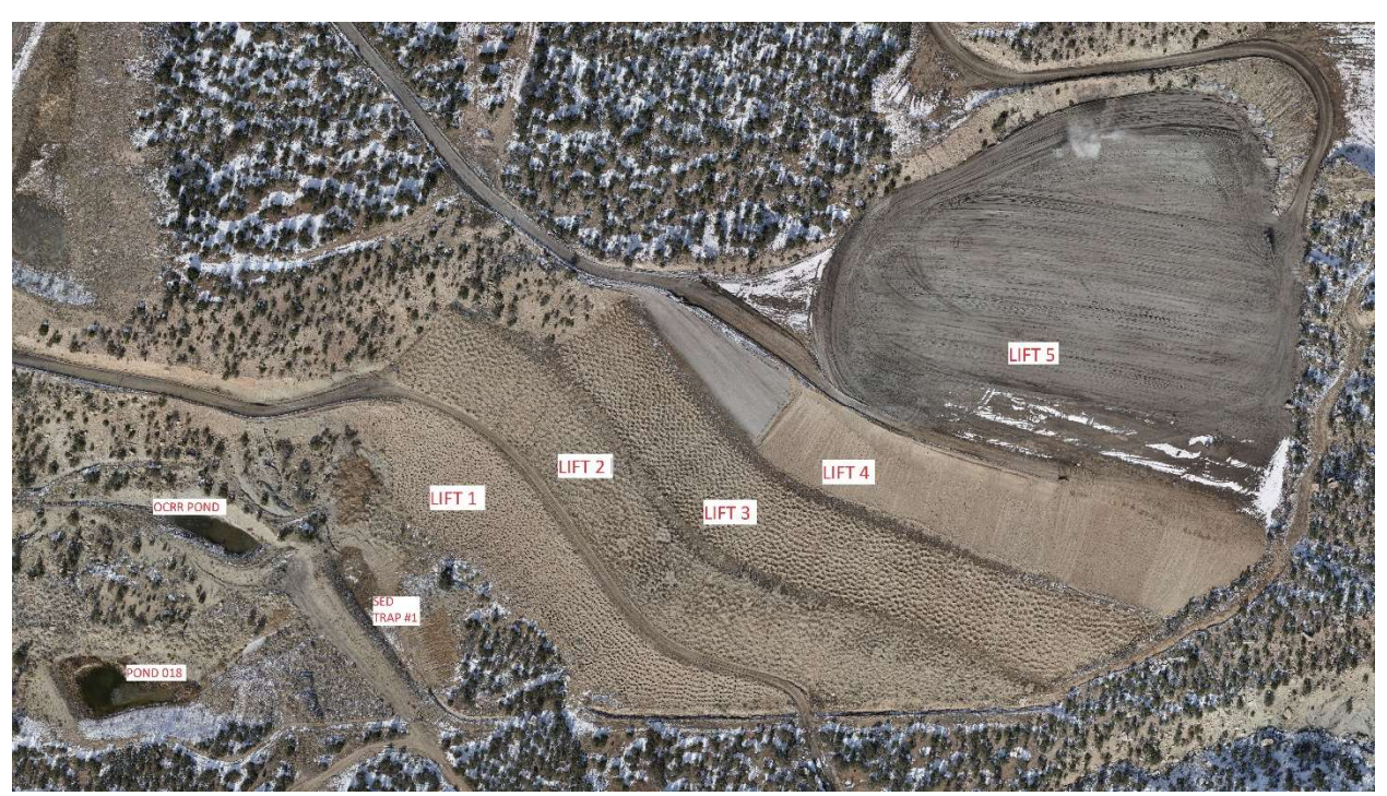
SCA#2 Ash Landfill – Aerial view Lift #5 in progress