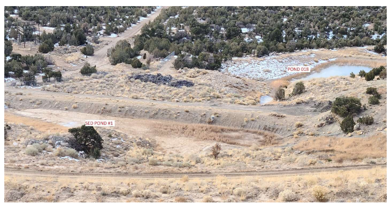
Sediment Trap #1 is empty and clean water flows from trap to pond 018 in normal open condition.