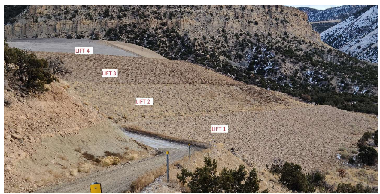
SCA#2 Ash Landfill –looking southeasterly