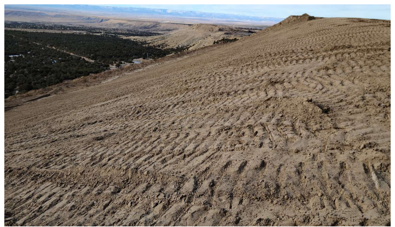
Face of Lift #4 – soil cover in process – photo looking northwest