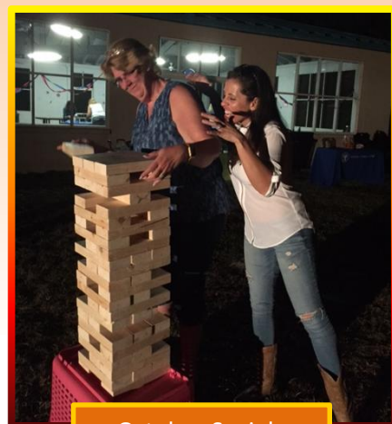
October Social: Denim and Diamonds Hoedown