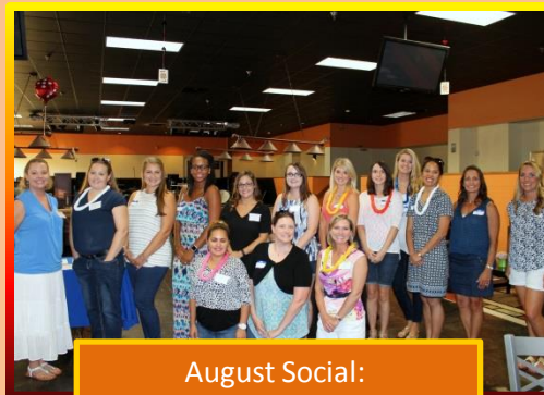
August Social: The HSC Price Is Right Night