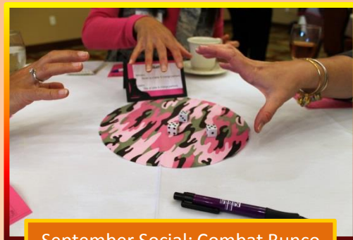
September Social: Combat Bunco