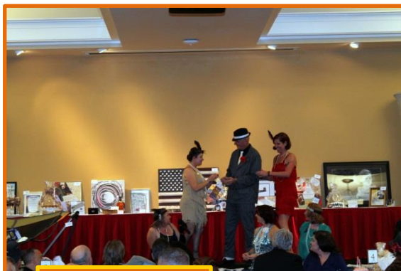
2016 live auction