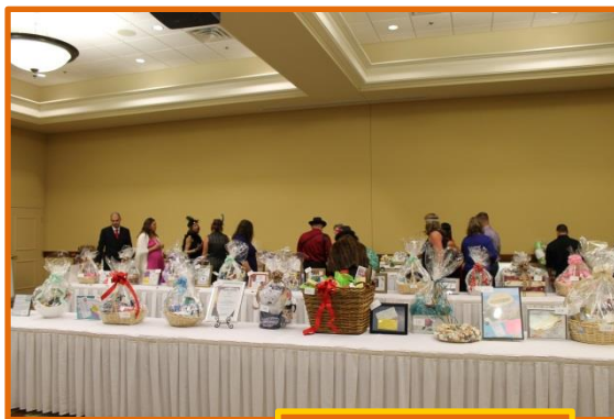
2016 silent auction