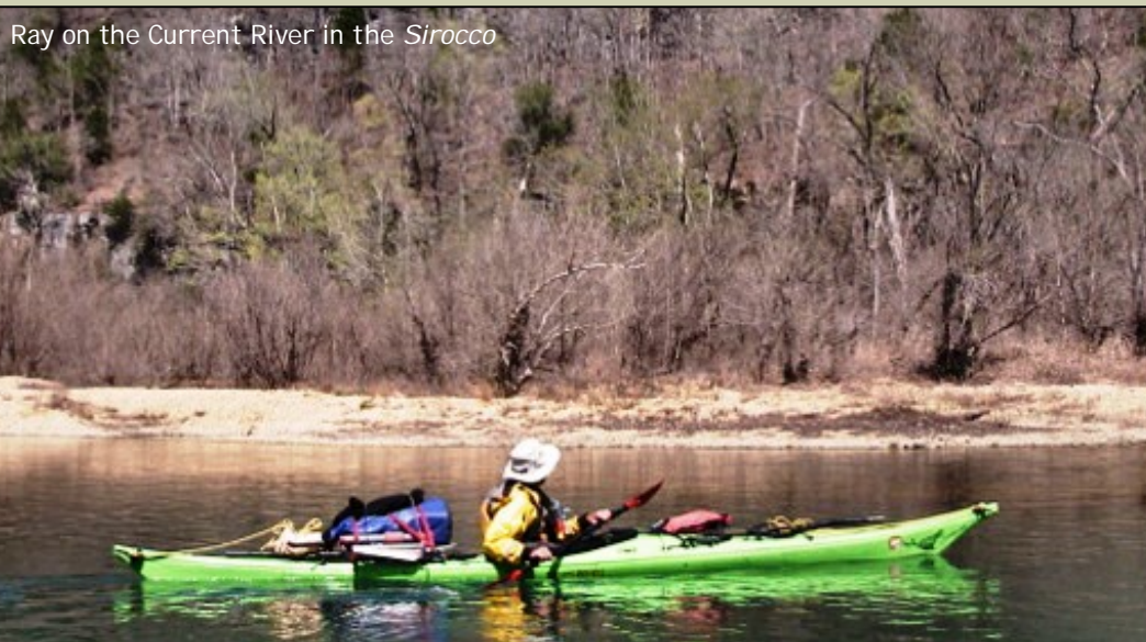
Ray on the Current River in the Sirocco