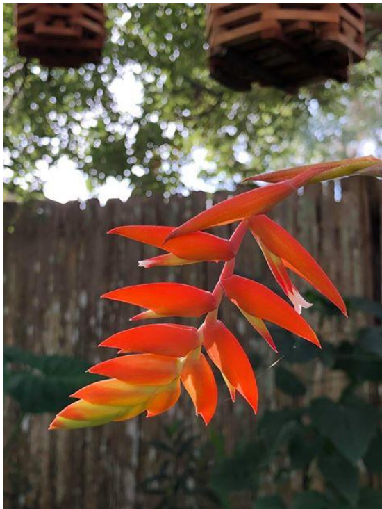
11/25/18 Plant Picture of the Day: Racinaea dyeriana Bromeliad