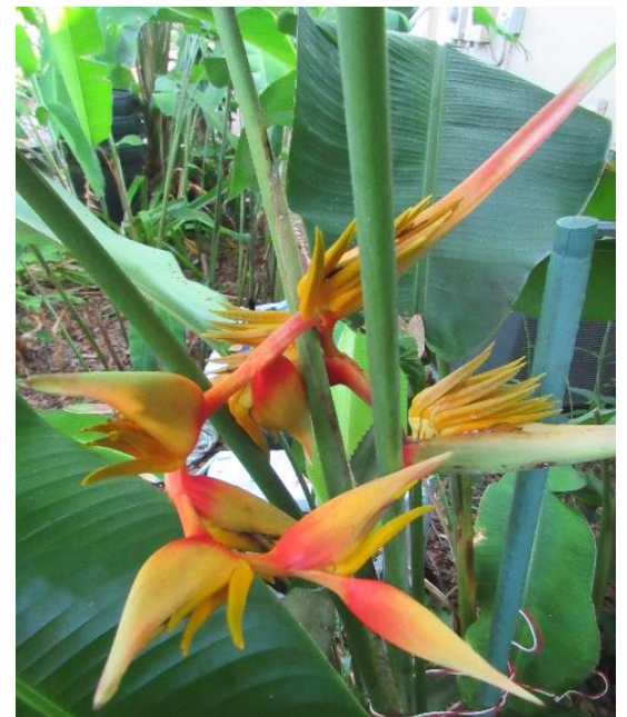
11/20/18 Plant Picture of the Day: Heliconia latispatha x collinsiana 'German's Luck'