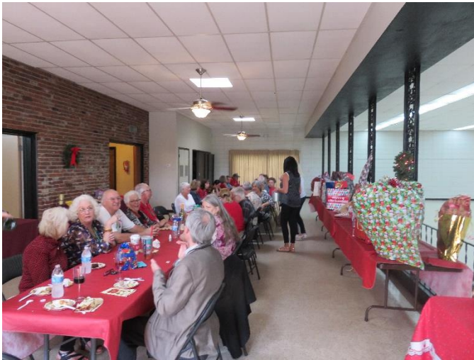
A Scene from the 2017 Holiday Party

Please RSVP by Dec. 14 th to sanfordgardenclub@gmail.com .