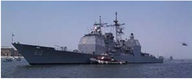
Guided Missile Cruisers,