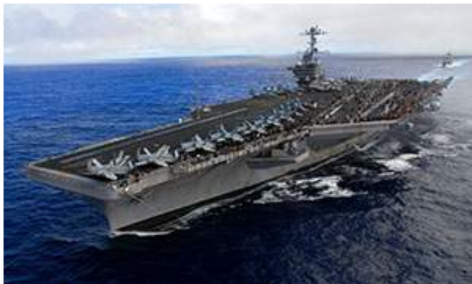
Aircraft Carriers and more.