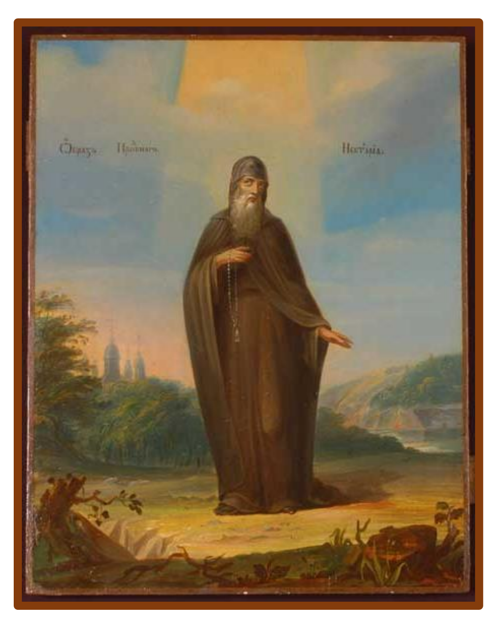
Sts. Peter & Paul Orthodox Church Youngstown, Ohio 44509