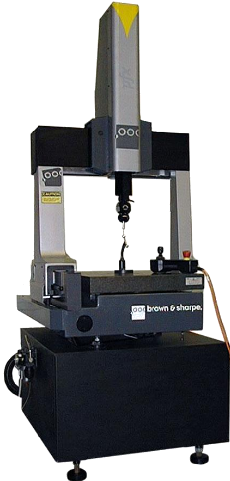
Image is not actual machine

Measuring Range: X: 458 mm (18") Y: 510 mm (20") Z: 406 mm (16")