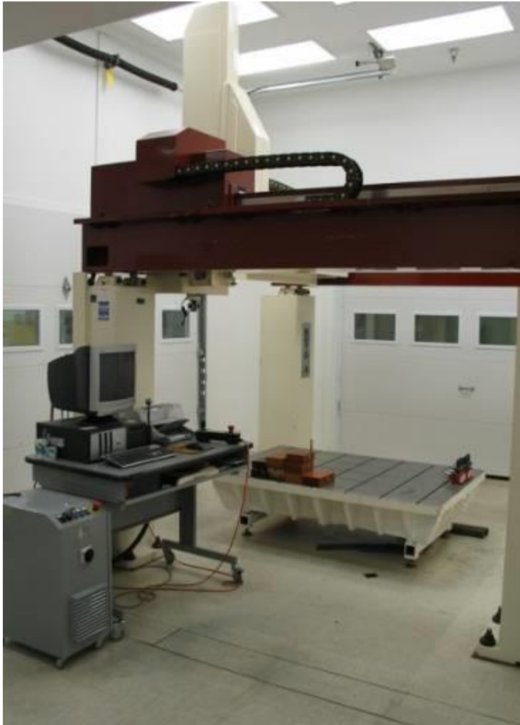
Image is actual machine