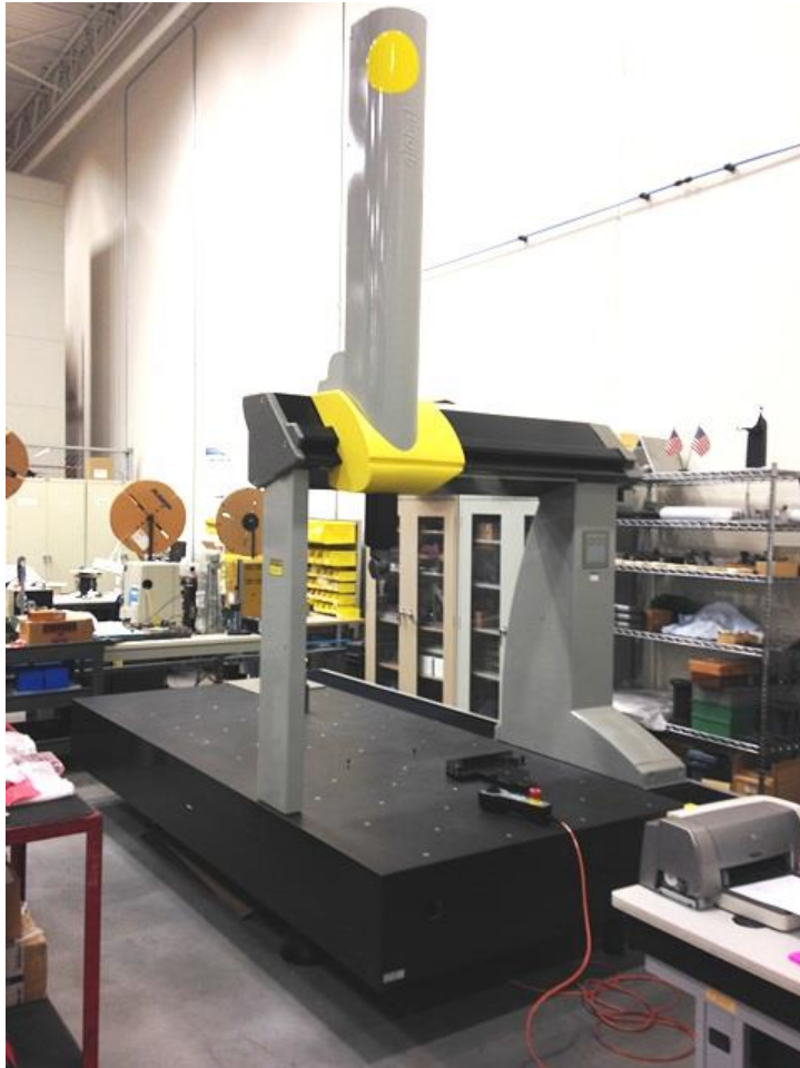
Image IS actual machine

Measuring Range: X: 1200mm / 47.2" Y: 2200mm / 86.6" Z: 1000mm / 39.4"