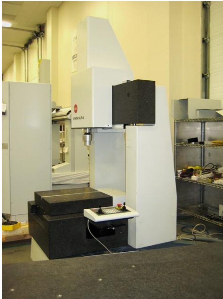
Image is actual machine