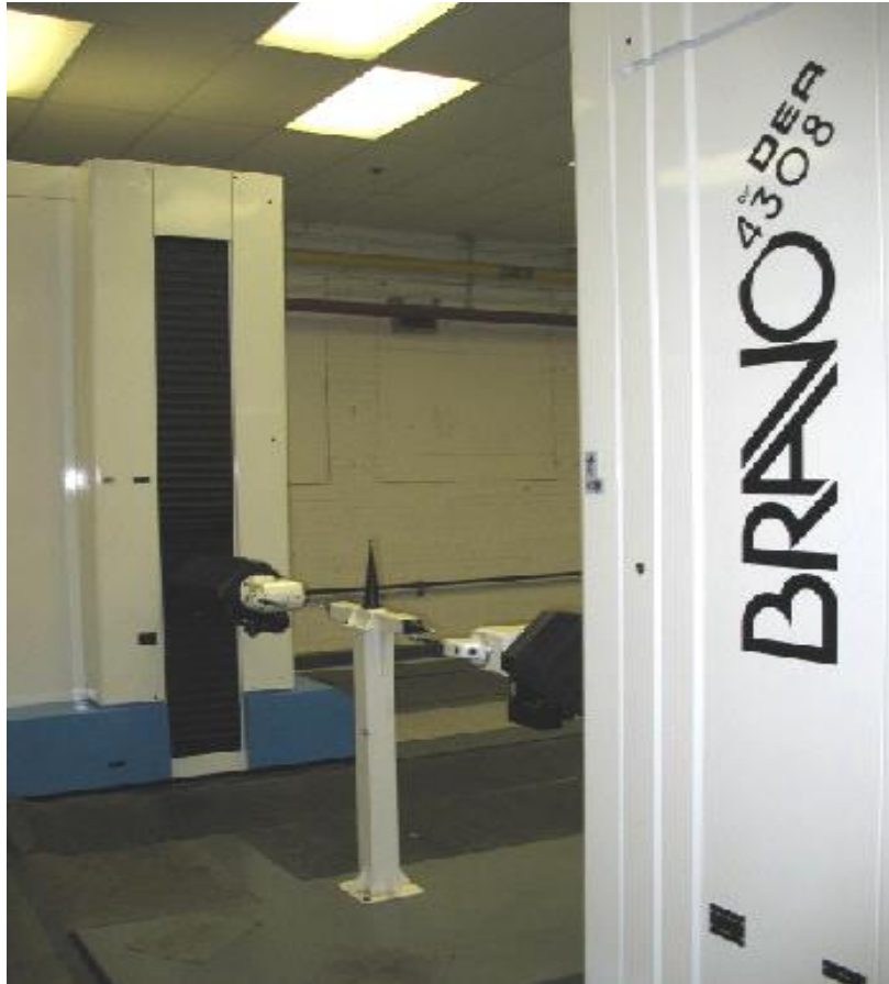
Image is actual machine