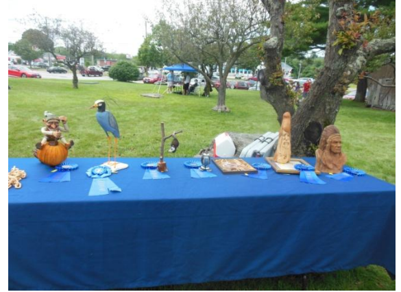
1st Place Table, Congrats to All!