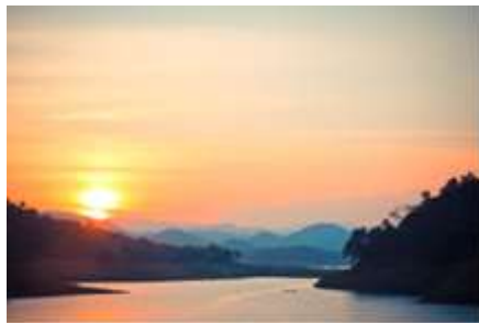
Sunset in the Sacramento Delta

Early registration rates for the 25 th Annual California Water Policy Conference expire Friday March 25. This year's theme, appropriately titled, Silver Anniversary No Silver Bullet , will be held for the first time at the UC Davis Conference Center on April 20 & 21, 2016. For more information about speakers and to register visit the California Water Policy Conference website .