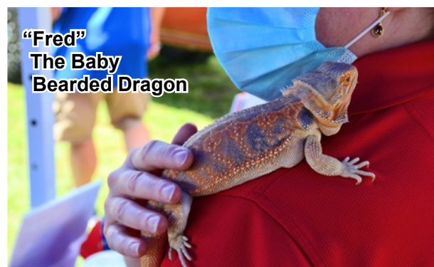
"Fred" The Baby Bearded Dragon