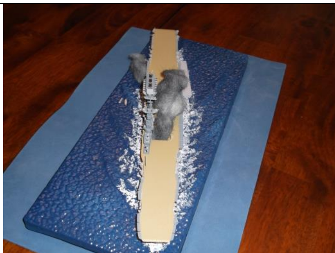
USS Lexington @Battle of Coral Sea after air attack Trumpeter 1/700