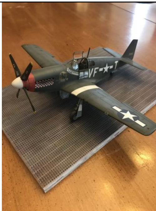
1/48 Scale Tamiya P51-B Mustang (Don Gentile markings) Craig Brown