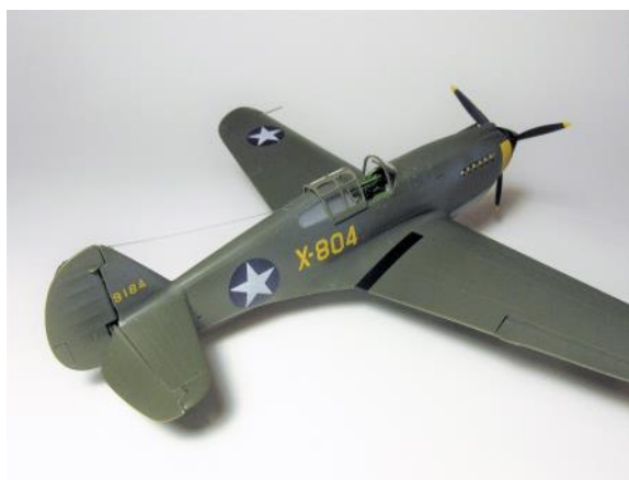
Airfix 1/48 P-40B. Markings are for a transition trainer used by pilots going into single engine fighters at Luke Field in 1943. It had no guns.