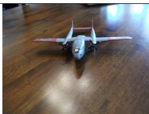
1/144 scale C 119 by Rodan.