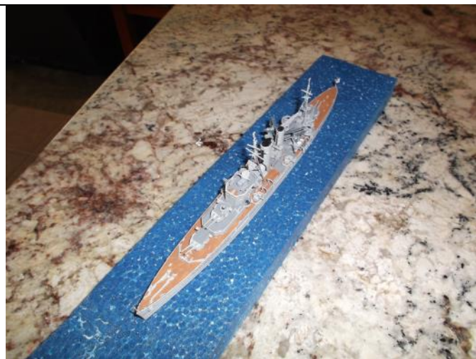
Aoshima 1/700 York Class WW 2 cruiser, either Exeter or York