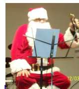
A special Guest