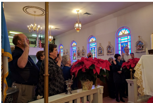
Parish Committee recites Oath of Office