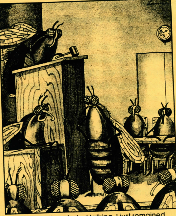
"So once they started talking, I just remained motionless, taking in every word. Of course, it was just pure luck I happened to be a fly on the wall."