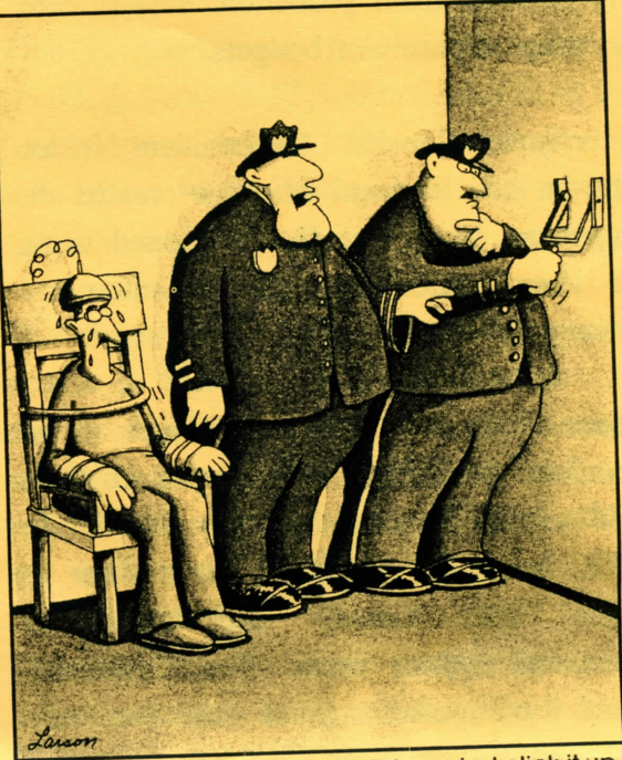
"The contact points must be dirty . . . just click it up and down a few times."