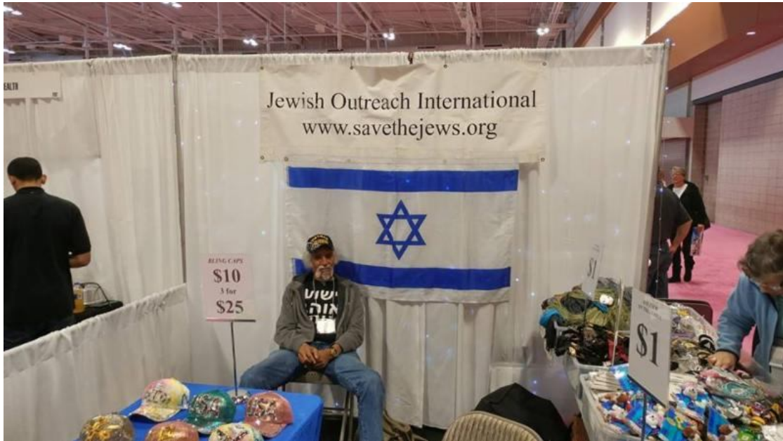
2018 Southern Women's Show

"Again I ask: Did they stumble so as to fall beyond recovery? Not at all! Rather, because of their transgression, salvation has come to the Gentiles to make Israel envious. But if their transgression means riches for the world, and their loss means riches for the Gentiles, how much greater riches will their fullness bring!"-Romans 11:11-12