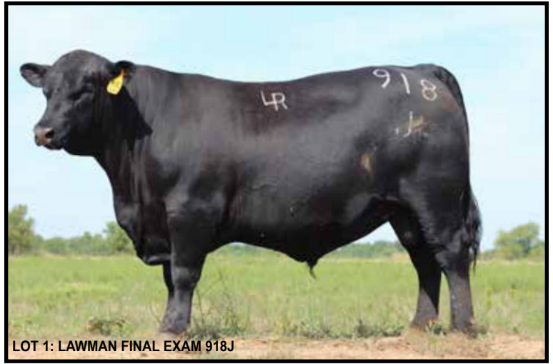
LOT 1: LAWMAN FINAL EXAM 918J

Outstanding UB cross of Payweight X Final Exam. Very easy fleshing bull that adds pounds and carcass while maintaining small BW. PV and GEPD's