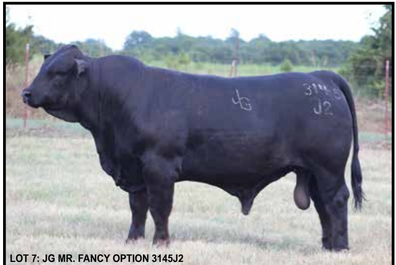
LOT 7: JG MR. FANCY OPTION 3145J2

If searching for a Bull to add pounds and red meat to your cow herd then look this guy over. You will appreciate his temperament and length of body which he displays.