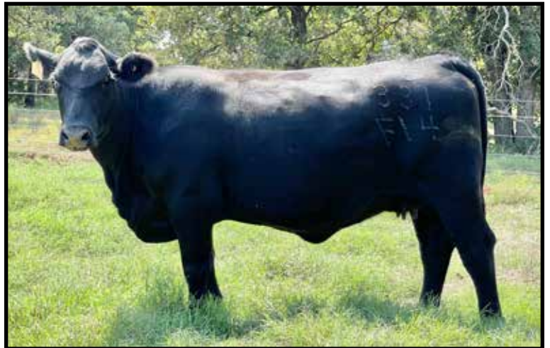
LOT 42: VOREL MS EFFECTIVE 331F14

The 331 cow family is famous across the breed. This young cow has done an exceptional job. Her bull calf will most likely head to CRC. Big bonus, she is A.I. bred to one of the most successful UB bulls in our breed Vorel Abstract. AI'd 4/15/2022. Confirmed bred.