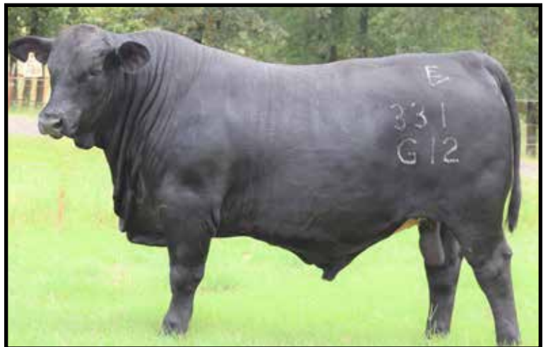
VOREL AUTHENTIC 331G12, SIRE OF LOT 40A AND 41A

Confirmed Preg. Our Template daughters have done a great job here. Very fertile & productive. Her Currency bull calf will be headed to Chimney Rock for the spring bull sale.