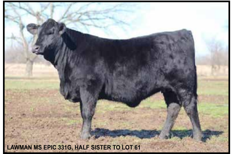
LAWMAN MS EPIC 331G, HALF SISTER TO LOT 61

Rare opportunity to purchase a Masterpiece daughter. She is a ET daughter out of a excellent donor 331D5 w/ full brothers and sister selling at CRC. PV and GEPD's