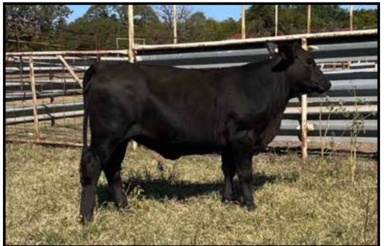
LOT 43: -G- MISS PASSPORT 881J

Passport sired female that has eye appeal w/ moderate BW and good growth numbers.