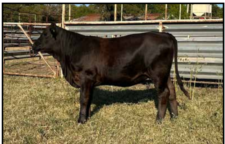
LOT 44: -G- MISS AVIATOR 343J

Aviator back to swagger female promises to be a very maternal cross.