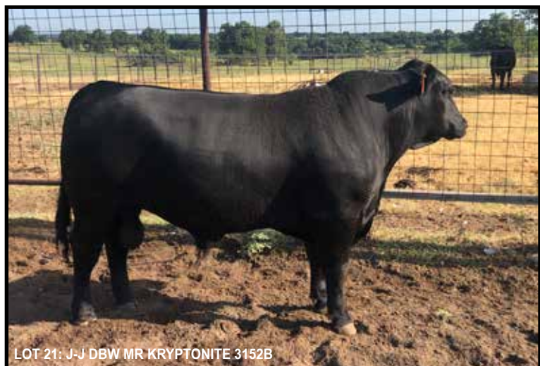
LOT 21: J-J DBW MR KRYPTONITE 3152B

J-J DBW MR KRYPTONITE 315/21B is grandson of the popular TJM Three D 302A bull. 315/21B is a well-balanced bull with a clean sheath, good muscling and a great disposition. His actual birth weight was 70 pounds and he has a scrotal circumference of 38 centimeters. We think that he could work well on a variety of cows and should have a promising future.