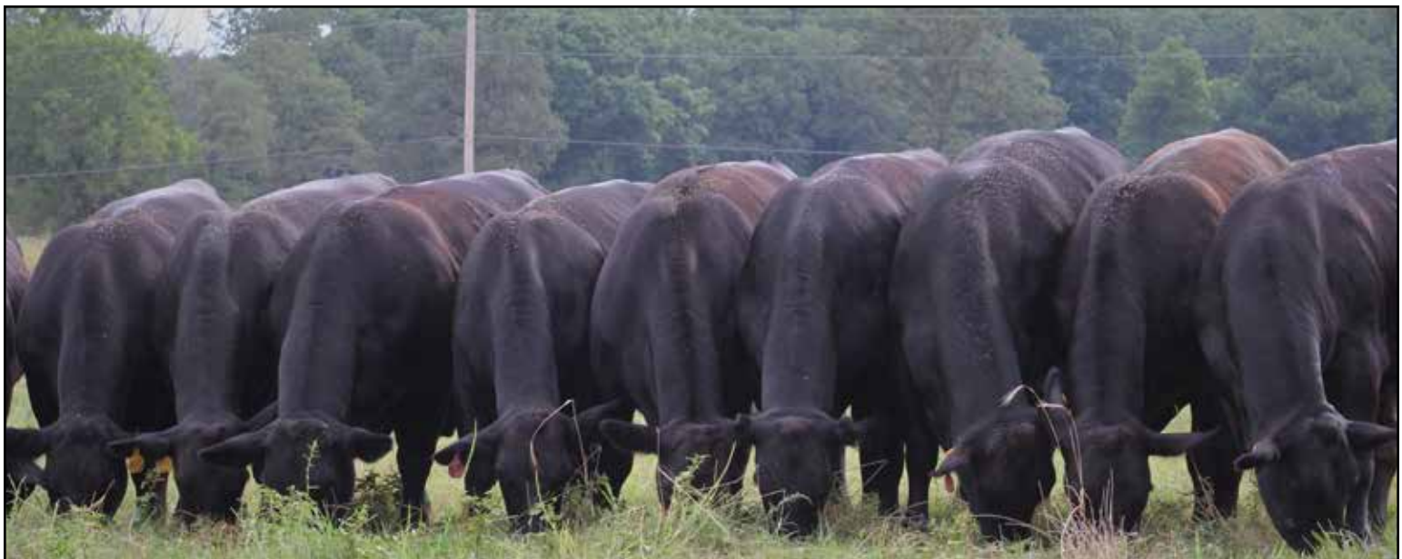
Lots 70-77, Gorczyca and Sons Commercial Bred Heifers

R numbered female out of a very maternal Dimension daughter. With Template on the top side sure to make a great female. PV and GEPD's.