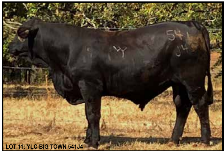
LOT 11: YLC BIG TOWN 541J4

Herd Sire prospect. ET son out of Big Town and our 541Z Cadence donor. He is wide based, big middled, stout topped, w/ outstanding structure. 12 traits in the top 35%. PV & GEPD's