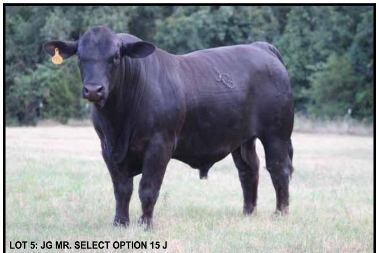
LOT 5: JG MR. SELECT OPTION 15 J

If looking for a low BW and docile herd sire stop and view this fellow. He is also very clean in his underline as well as sound on his feet & legs while on the move.