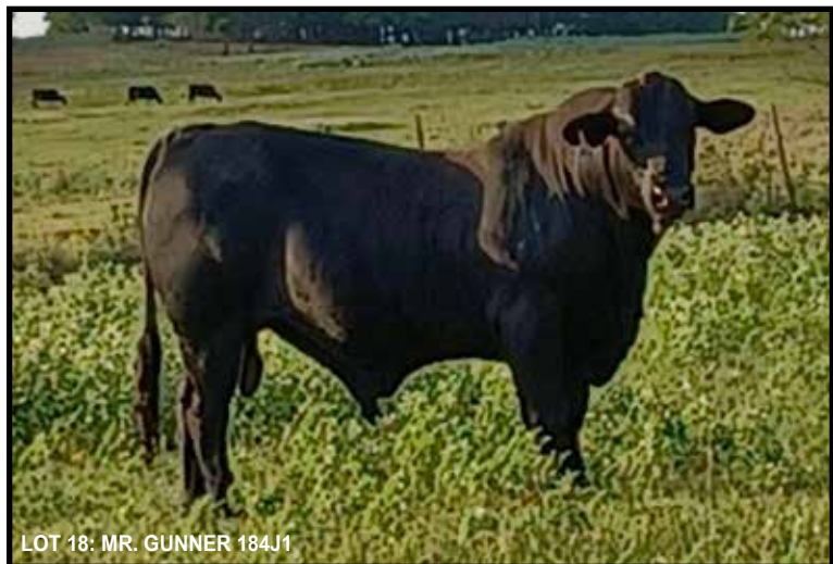
LOT 18: MR. GUNNER 184J1

If your looking for a herd sire, look at this moderate frame bull w/ extra length of rib w/ ideal sheath and he comes from our 184 cow family w/ Cruise on the top.