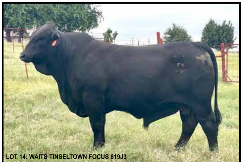
LOT 14: WAITS TINSELTOWN FOCUS 819J3

Nice bull w/ weaning weight in the top 15% and yearling in the 10%. PV and GEPD's