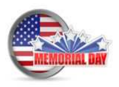
Remember - May 26th

Join CTCI now if you haven't yet. The Early Bird magazine alone is worth the dues.