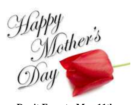
Don't Forget - May 11th

Wanted, A car with a "Dynaflex Superflowing Unijet Turbovasculator which is Syncromeshed to the Multicoil Hydrotensioned Dual vacuum Dynomometer."