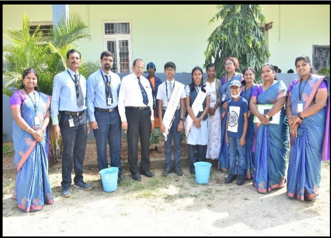
PLANTING OF SAPLINGS ON WORLD ENVIRONMENT DAY