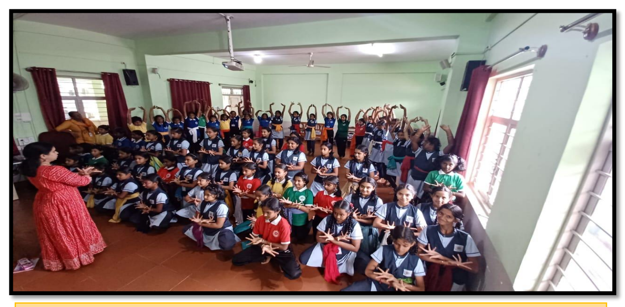
DANCE POSES IN CLASSICAL BHARATHANATYAM