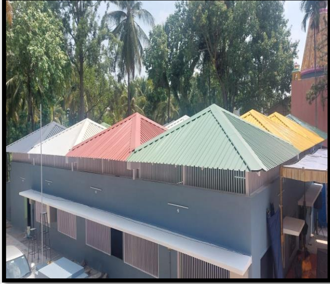
POOJA AT THE RENNOVATED BUILDING IN THE NURSERY BLOCK