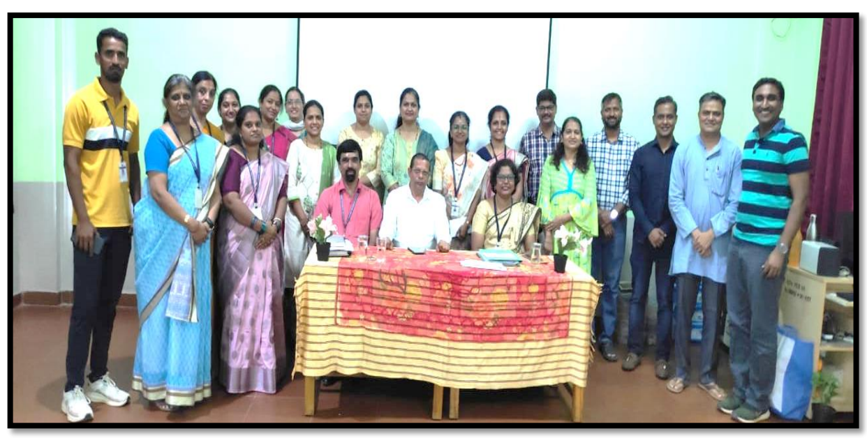
THE OLD AND NEW SMC MEMBERS

The SMC members function as responsible stake holders of the school bringing into light the various aspects of the school activities in different prospective. This ensures the smooth functioning of the school and its progress.