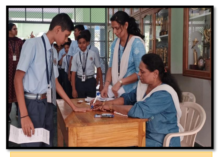
TEACHERS ON ELECTION DUTY

Free and fair election was conducted in the school, with utmost sanctity for electing the student leaders. The nominees' applications were filled by desirable students who are disciplined, altruistic and have exemplary grades. The nominated students campaigned in the assembly. The teachers and the students cast their votes. Polling booths were set up with tight security. A voting paper and a seal were given to the electors to mark the captains and vice-captains. The counting also happened with tight security.