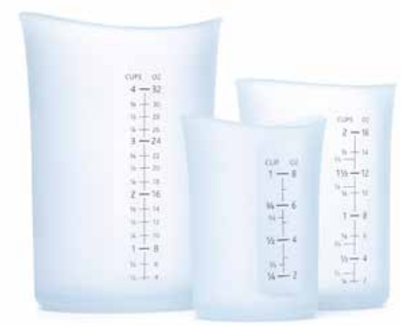
3 Piece Set B25300