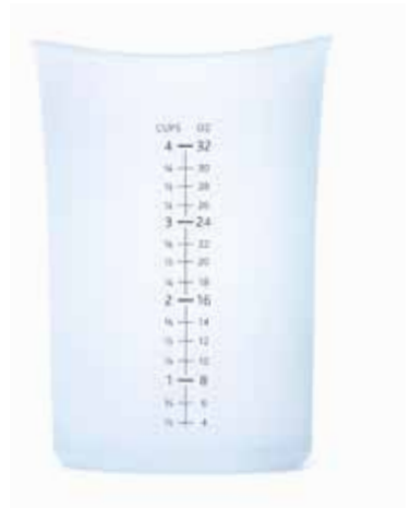
4 Cup (1000 ml) B26500