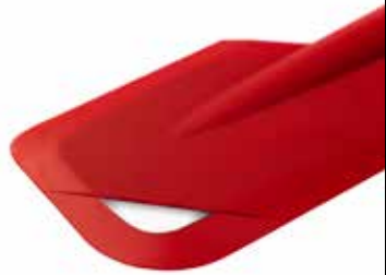
Spring-steel core keeps them slim and sturdy