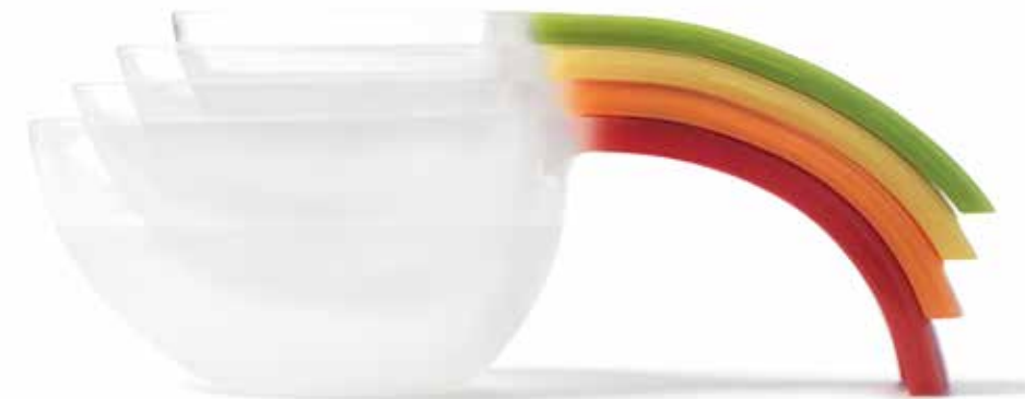
4-Piece Magnetic Measuring Cup Set B15600