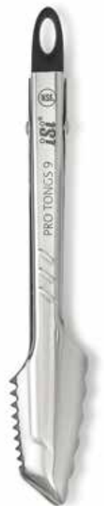
Pro Tongs™ 9” 2709