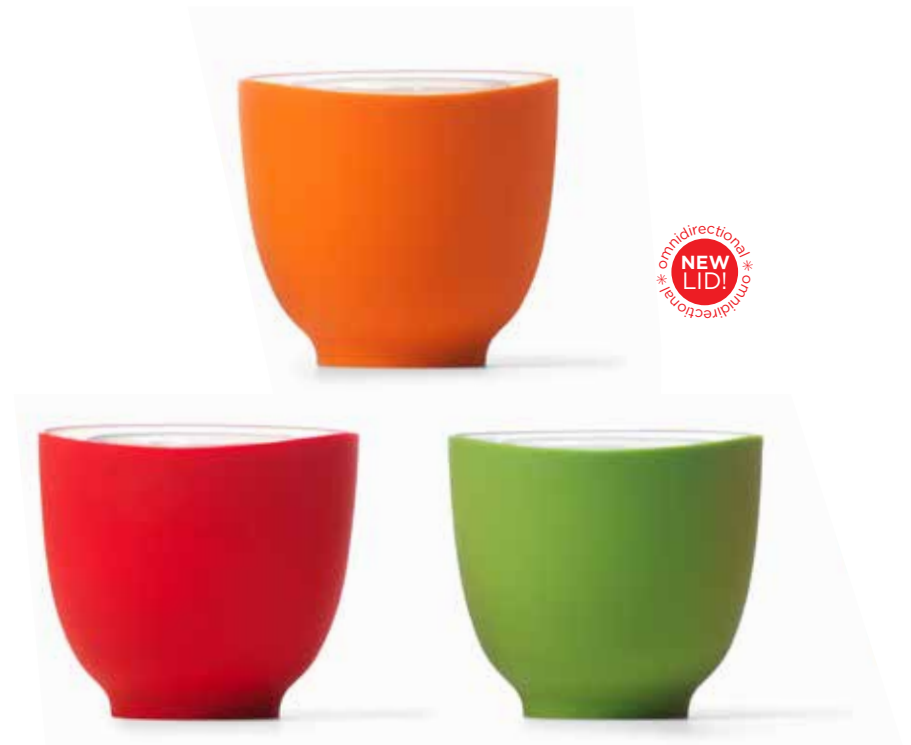
2 Cup Prep Bowl Set B25065