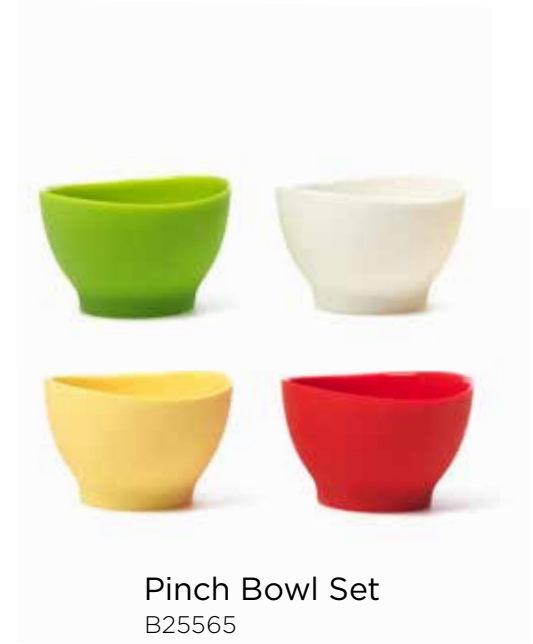
Pinch Bowl Set B25565