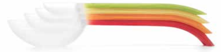
4-Piece Magnetic Measuring Spoon Set B15500