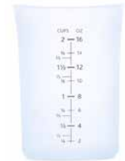
2 Cup (500 ml) B26400