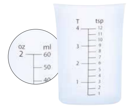
Mini Measuring Cup B26900