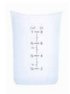
1 Cup (250 ml) B26300