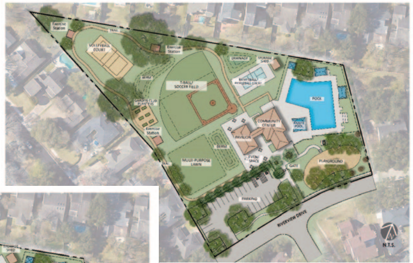
MASTER PLAN CONCEPT 'B'