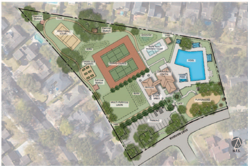
MASTER PLAN CONSENSUS CONCEPT 'A'