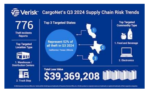
Cargo theft incidents in California, Texas and Illinois represent more than half of all theft recorded in the third quarter, CargoNet reported.

Compared to the third quarter last year, there has been a shift in targeted commodities. Thieves are not focusing as much on solar panels, motor oils and energy drinks as they were a year ago. There has been increased focus, however, on footwear, computers, high-end audio systems and hard liquor.