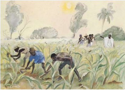
The Late-arriving Workers by Jesus Mafa

Thank you for joining us for worship today.