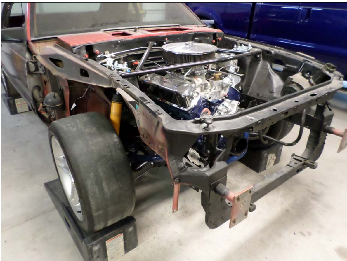
Terry Myers' '82 Mustang GT being built for future Auto X action. Rebuilt engine for more power, suspension mods and really big DOT racing tires