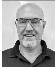
Kent Christian Council Delegate