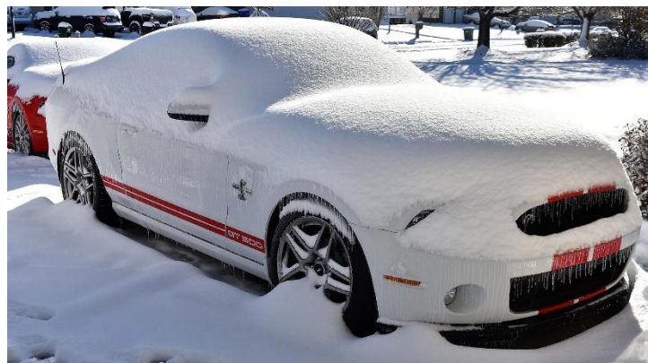
Lots of snow!